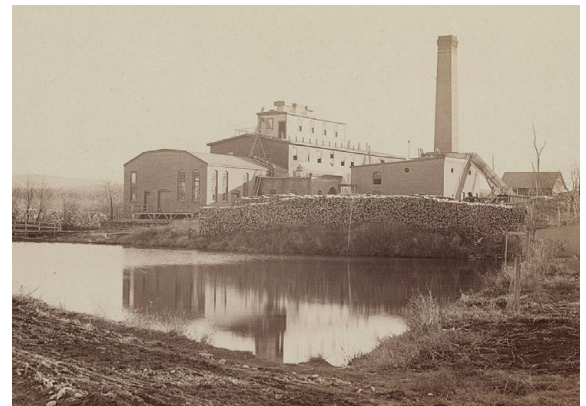
New England Fibre Mill, Riverside, 1886-1901