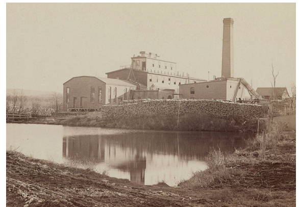
New England Fibre Mill, Riverside, 1886–1901