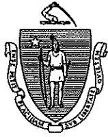
CHARLES D. BAKER Governor