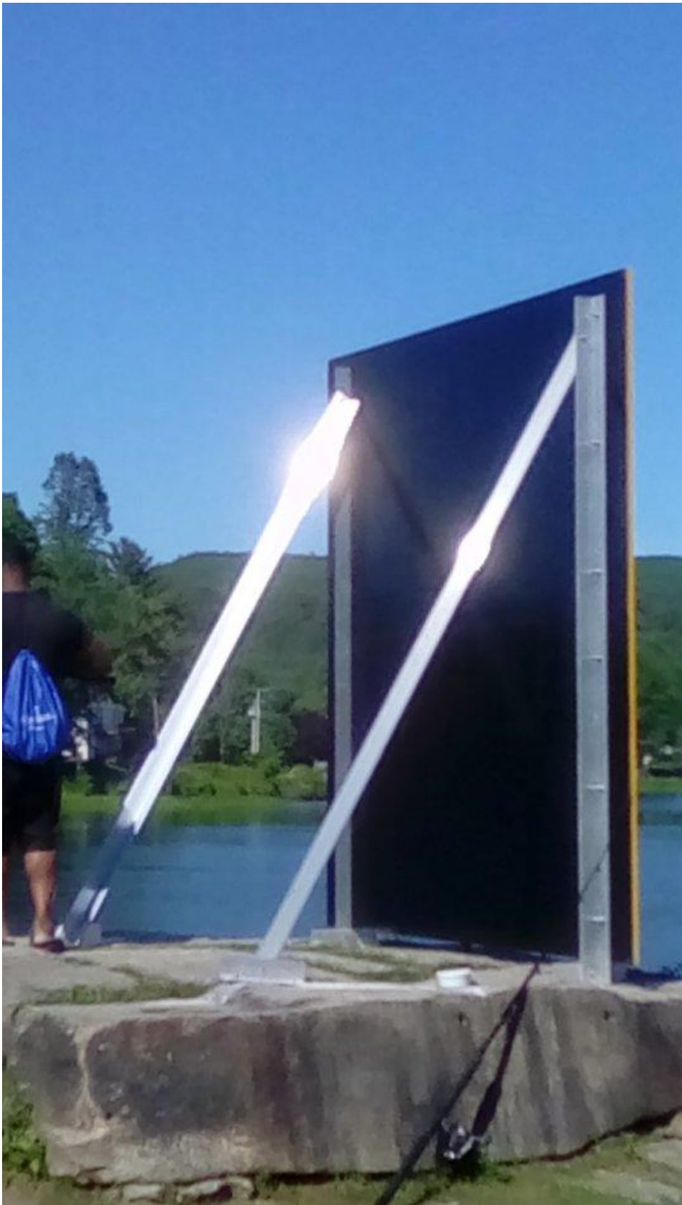
Bridge abutment and “new” warning sign installed June 2019 on Montague side of the river. Sign measures 8 foot by 8 foot. Photo does not show the “old” sign that has not been removed. Cannot see the graffiti on the back of the sign.