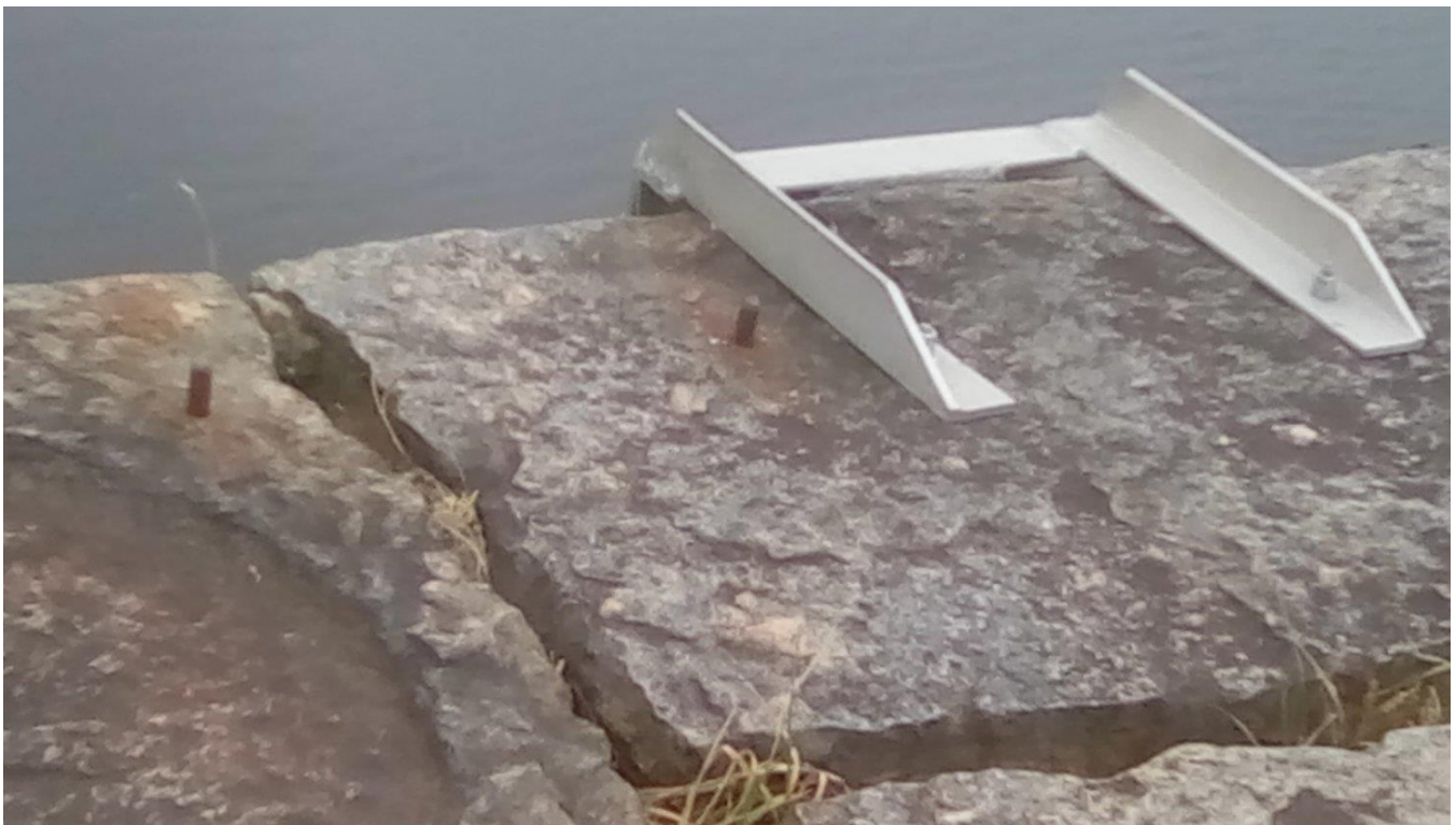
Old mounting posts (left) and new mounting bracket (right) for river depth gauge attached on upstream side of bridge abutment