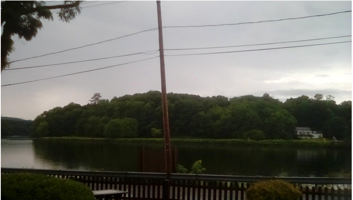
Utility wires on Gill side of the river, upstream of the bridge abutment. The back of the current warning sign on Gill side of the river is seen as a faint rectangle behind the utility pole. The warning sign on Montague side of the river can be seen at the right side of the photo.