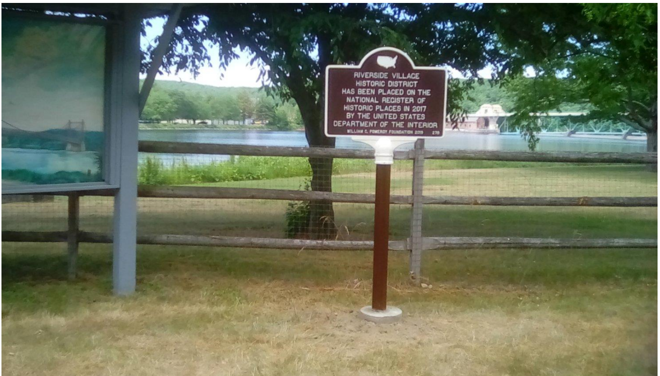
Newly installed (June 2020) sign commemorating Riverside Village Historic District. At left is the mural of the Red Bridge.