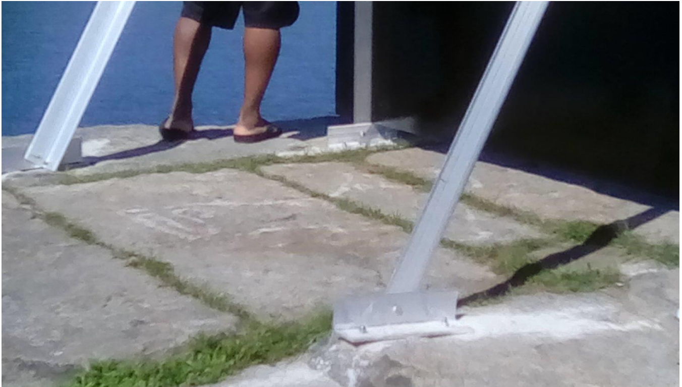
Warning sign mounting brackets on bridge abutment on Montague side of the river. Notice sharp edges, potential trip hazard, and proximity to the river edge of the abutment.