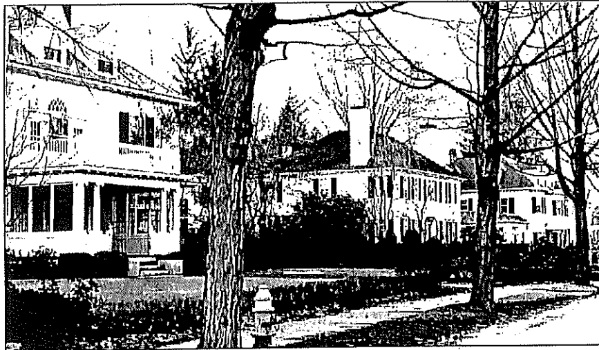
Massachusetts Avenue Historic District, Worcester, both a Local and National Register Historic District

Can a property be designated both as part of a National Register District and as a part of a Local Historic District?