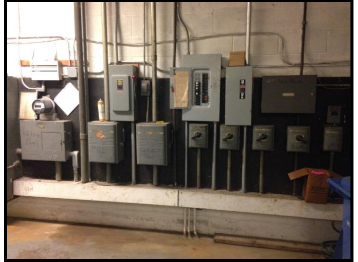
Gill Elementary School – basement wall full of older and newer electrical panels and disconnects. (Main panel is partially visible at the far left of the photo.)

Photograph of wheelchair ramp at Riverside Building to be inserted above.