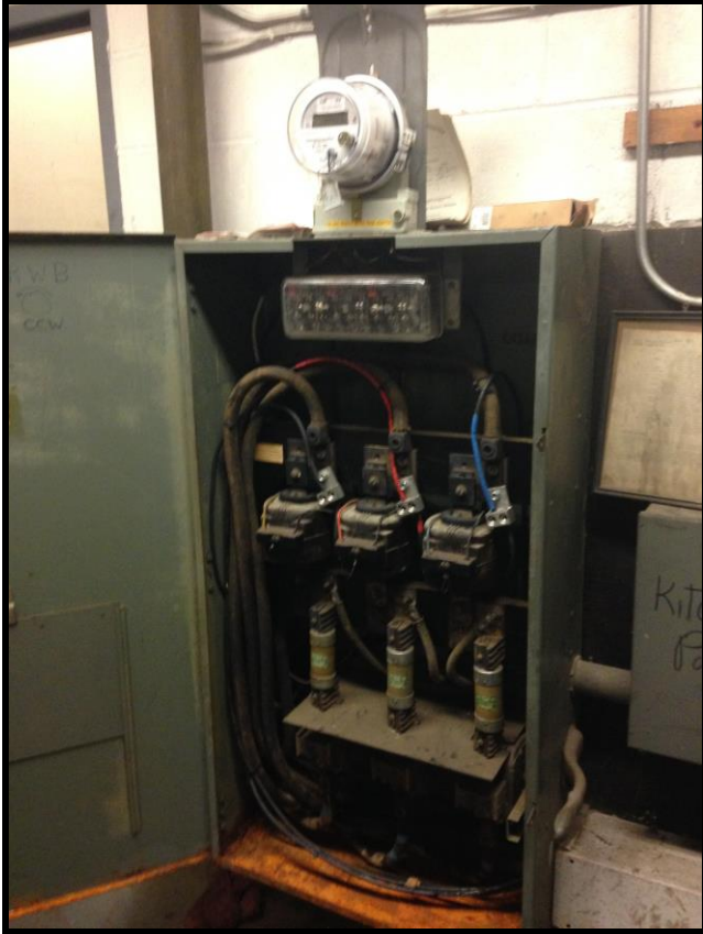
Gill Elementary School – main electrical panel