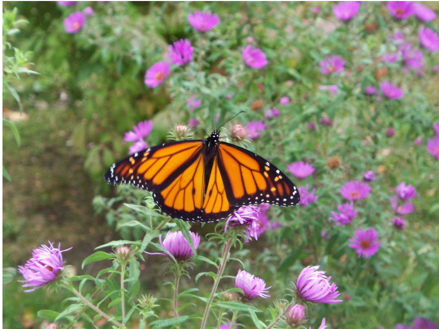
Photo: A freshly hatched monarch butterfly spreading its wings on the asters at Town Hall