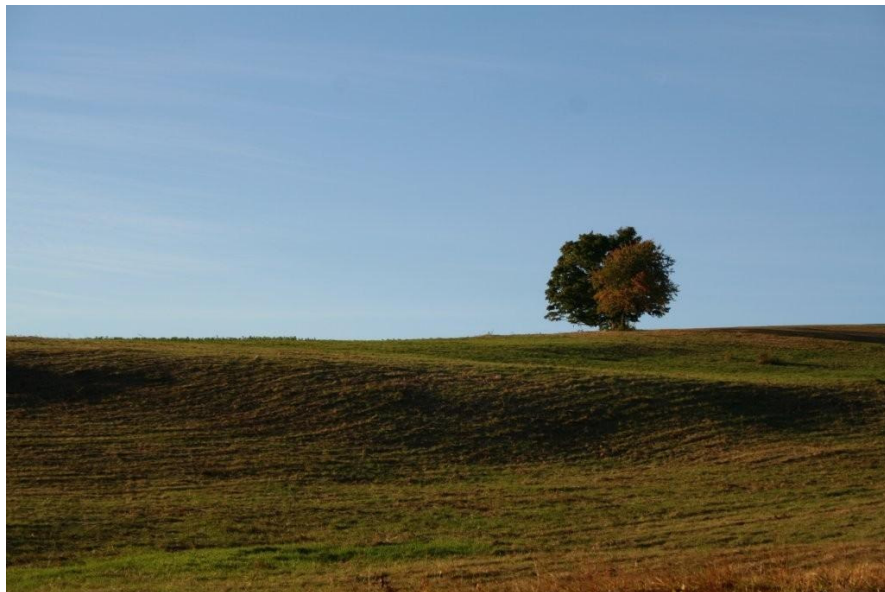
Field on Franklin Road